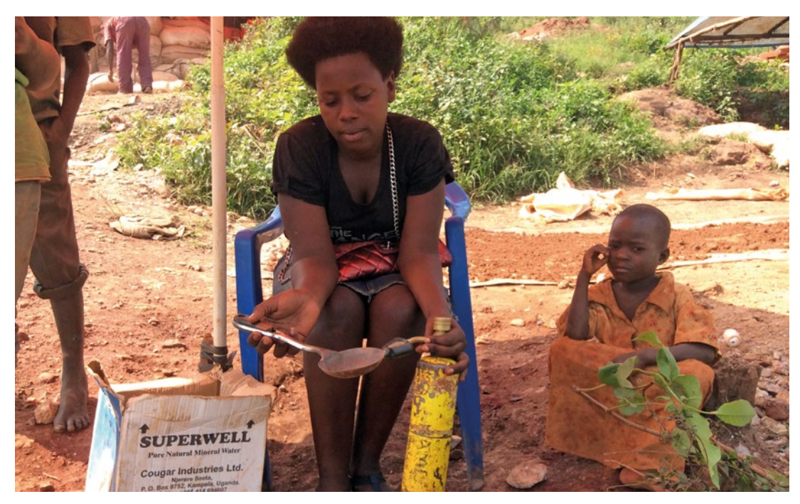
The on-site gold buyer burns the mercury-gold amalgam to evaporate the mercury

When there is not enough water available on the site to use the sluices, or when miners cannot afford to use sluices, the washing of the ore dust takes place in ponds using the method of panning.