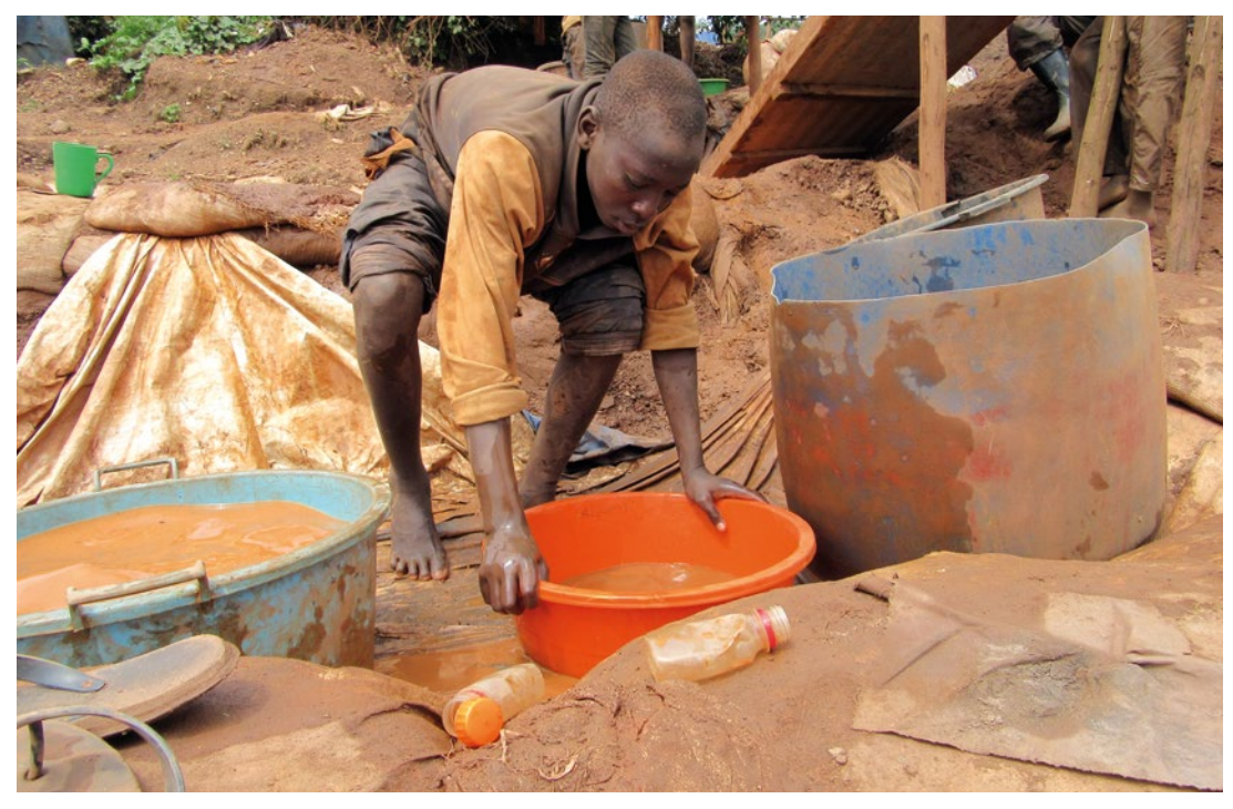
The concentrated ore dust is mixed with mercury to bind the gold