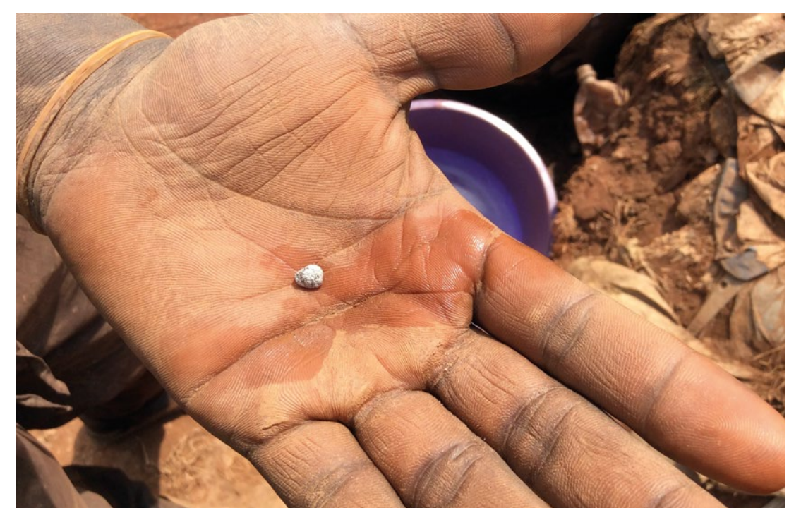
The mercury-gold amalgam