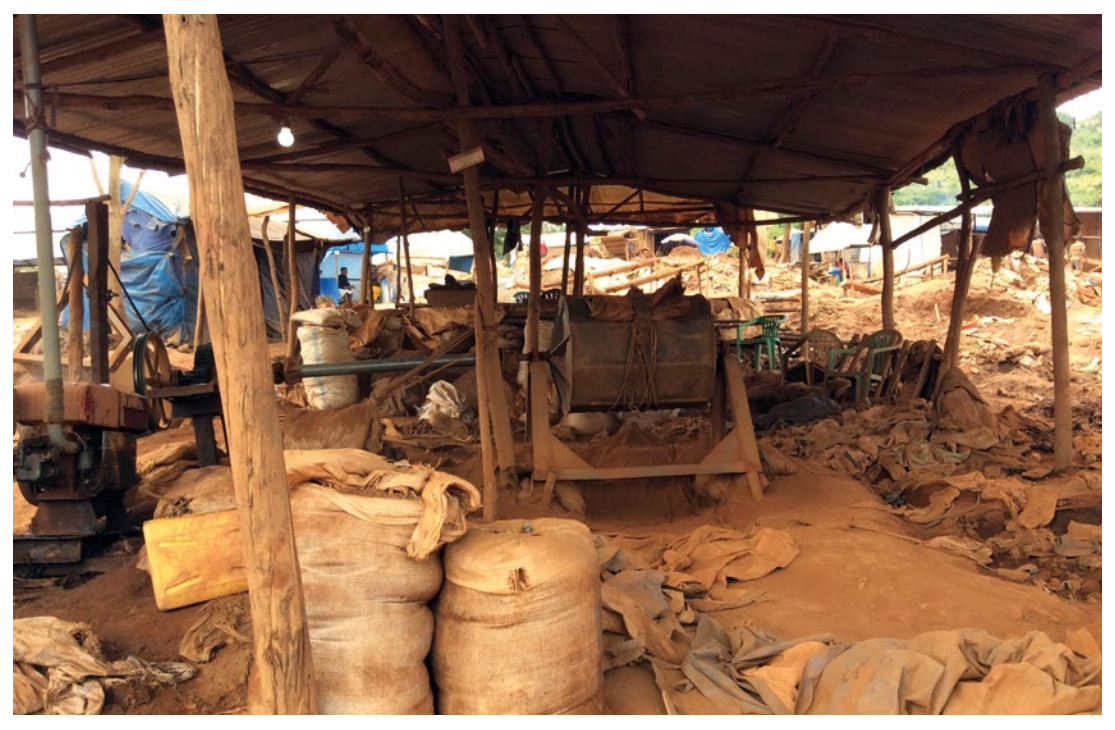
In a mill the gold ore is being grinded into gold ore dust