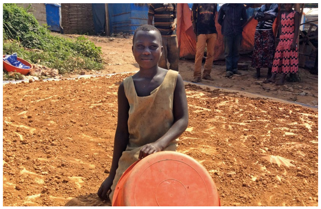
The gold ore is dried in the sun