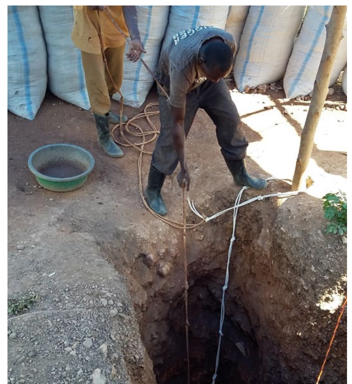
Miners dig up the gold ore from the underground mining pits