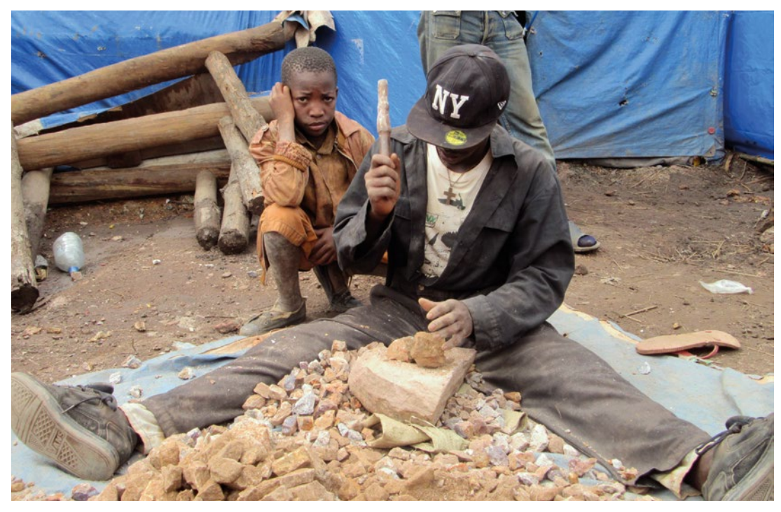
The bigger rocks of gold ore are pounded with a morter into smaller pieces