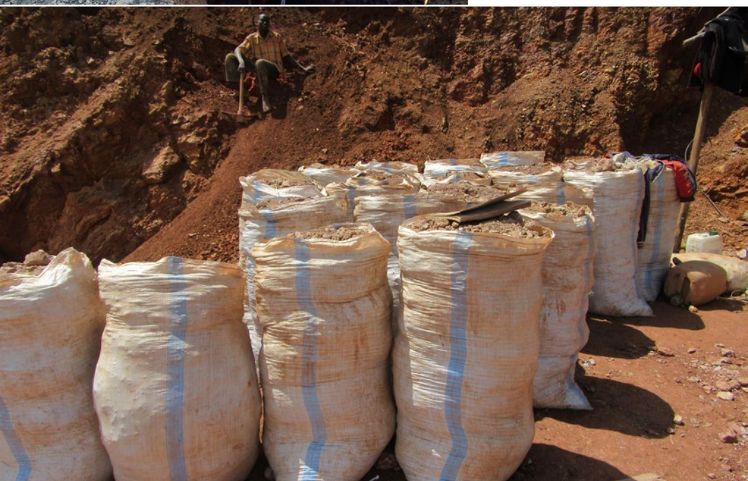
Bags with rock gold ore from the mining pits are for sale